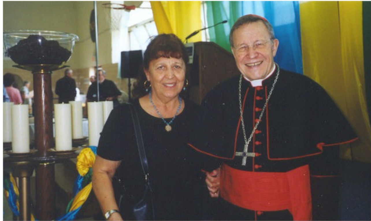
Cardinal Kasper with Audience Member