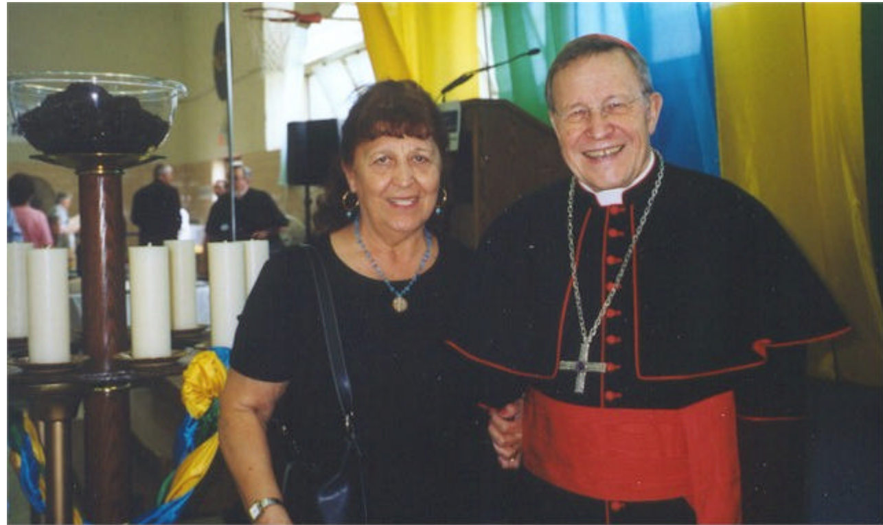
Cardinal Kasper with Audience Member